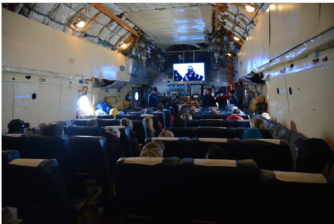
Inside the Soviet-era Ilyushin IL-76, which ferries visitors from Punta Arenas, Chile to Union Glacier, Antarctica. For those missing pre-00s air travel, take note of the single drop-down movie screen.