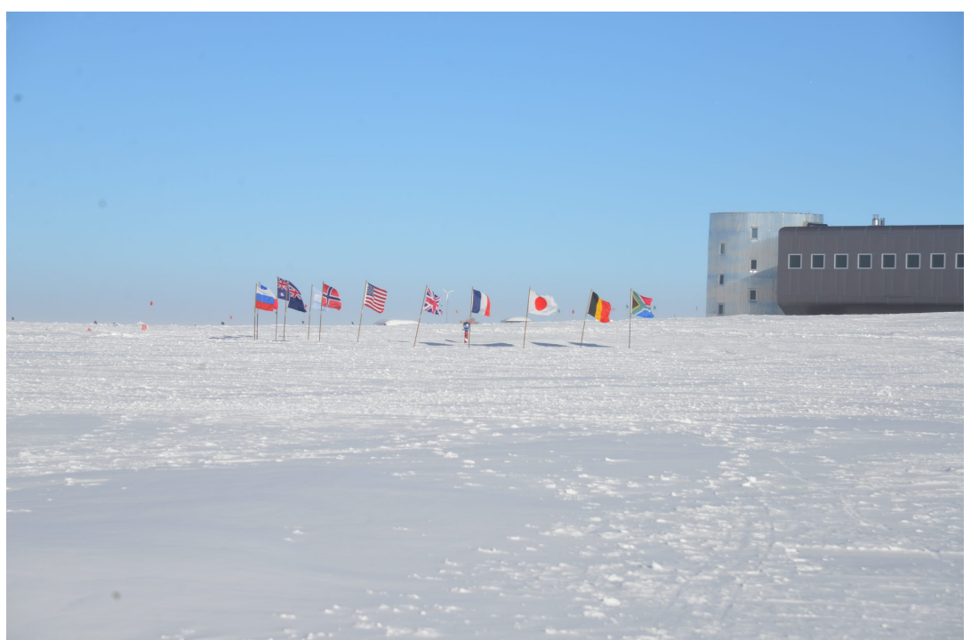
The Antarctic Treaty System governs Antarctica, and no one officially owns the continent, although seven countries have territorial claims over differently sized slices, and approximately 30 countries have a permanent research station.