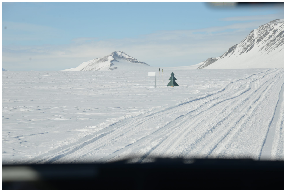
A lonely metal Christmas tree stands guard beside one of Union Glacier's ice roads.