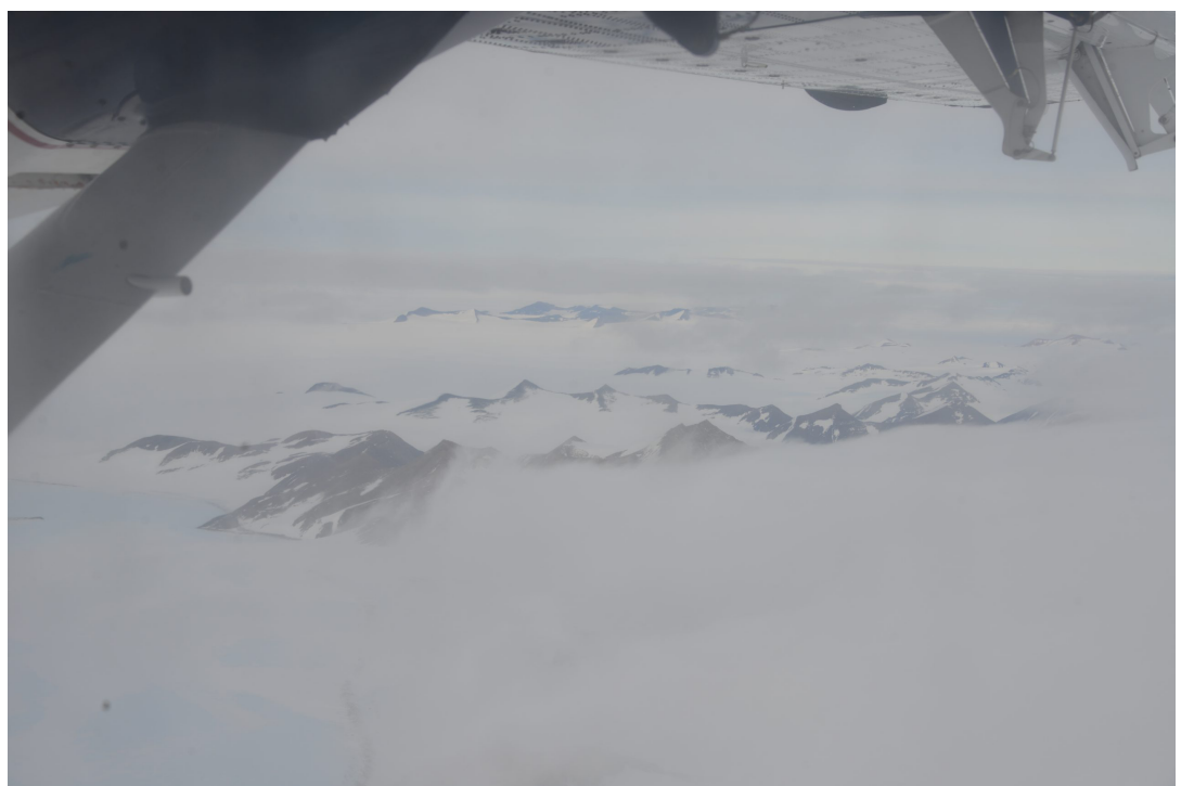
The Ellsworth Mountains between Union Glacier and Hercules Inlet. A 2016 study by the British Antarctic Survey found that only 0.18% of the continent is snow- and ice-free.