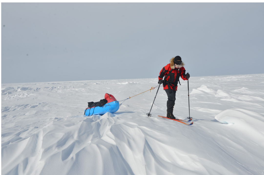
Hauling a sled over the sastrugi